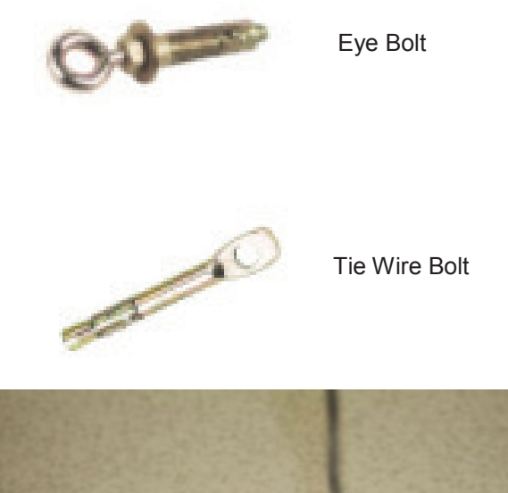
STEP 4 - Use the appropriate steel cable or chain to hang the panels from the structural ceiling fixings and to the spiral hooks at the rear of the panels. This item is not supplied.

STEP 3 - Install appropriate fixing bolts on the structural ceiling and align them with the position of the spiral hooks on the rear of the acoustic panels. This item is not supplied.