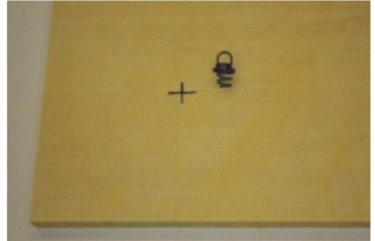
STEP 2 - Screw the appropriate number of spiral hooks into the marked positions through the back of the acoustic panel.

STEP 1 - Use clean white gloves to keep the panels free of any dirt marks during installation. Mark the appropriate number of positions on the back of the panels for the spiral hook to evenly support the acoustic panel.