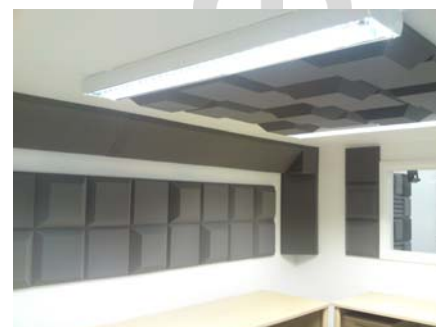
2" (50mm) Tegular Acoustic tile